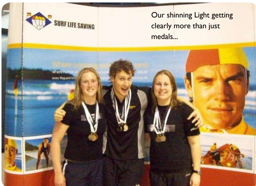
Our shining Light getting clearly more than just medals...