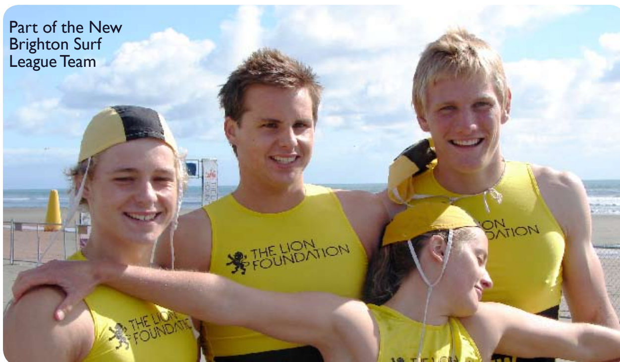
Part of the New Brighton Surf League Team