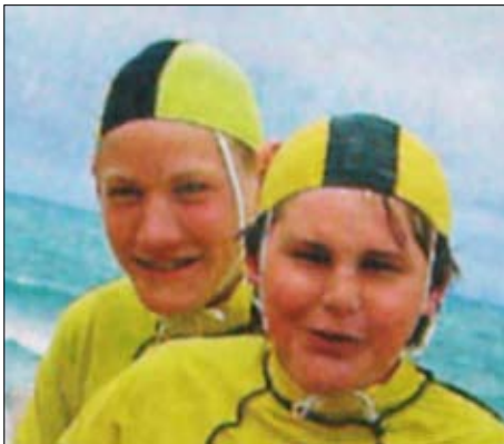
The Boys have come a long way from their first Christchurch Mail appearance as young U19 Boat Crew